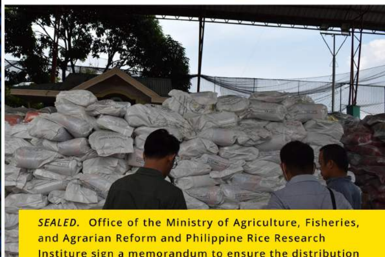
SEALED. Office of the Ministry of Agriculture, Fisheries, and Agrarian Reform and Philippine Rice Research Institute sign a memorandum to ensure the distribution of certified seeds of recommended rice varieties to eligible rice farmers beneficiaries at MAFAR Conference, BGC, Cotabato City, Monday April 12, 2021

T he Memorandum of Agreement signing between the Philippine Rice Research Institute (PhilRice) and the Ministry of Agriculture, Fisheries, and Agrarian Reform of the Bangsamoro Autonomous Region in Muslim Mindanao (MAFAR-BARMM) was held at MAFAR Conference, BGC, Cotabato City, Monday, April 12, 2021.