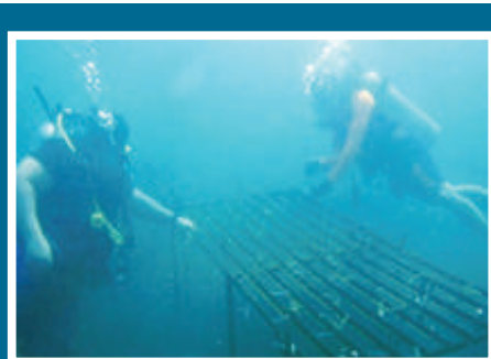
Assessment and validation of the area for coral nursery