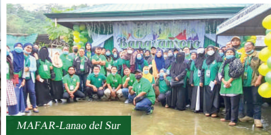
MAFAR-Lanao del Sur