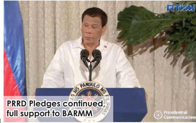
PRRD Pledges continued, full support to BARMM