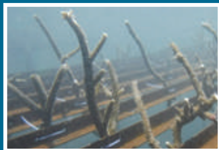
Live coral fragments were attached into man-made frame or cable structures. It serves as nursery of coral where they can grow and thrive