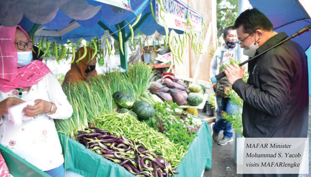
MAFAR Minister Mohammad S. Yacob visits MAFARlengke