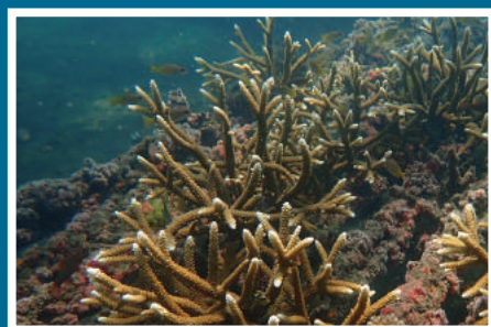
After a year of deployment, coral nursery with approximately 1,000 coral fragments or corals of opportunity thrives healthily, proof of which were fish stock density and coral recruitment increased

C oral Nursery Unit is a way of speeding up the recovery and restoration of a damaged reef by means of attaching live corals fragments into a man-made frame and cable. It serves as the nursery for corals where they can grow and thrive, and then later on will serve as a shelter and source of food for marine life.