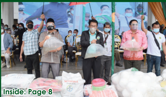
Inside: Page 8